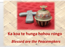
Ka koa te hunga hohou rongo Blessed are the Peacemakers

Thurs 6 Feb Waitangi Day Friday 7 Feb School closed