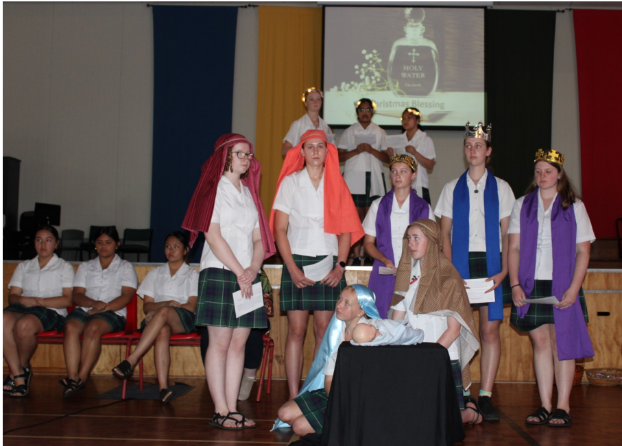
On Wednesday 11 December, an Advent and Christmas Liturgy was held in the Events Centre.