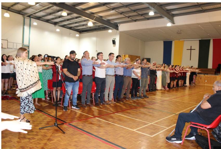
A Pōwhiri, held on Thursday 30 January 2025, welcomed all returning and new students/staff to the school year.

Opening Mass was held on Tuesday 4 February.